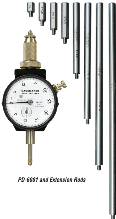
PD-6001 and Extension Rods